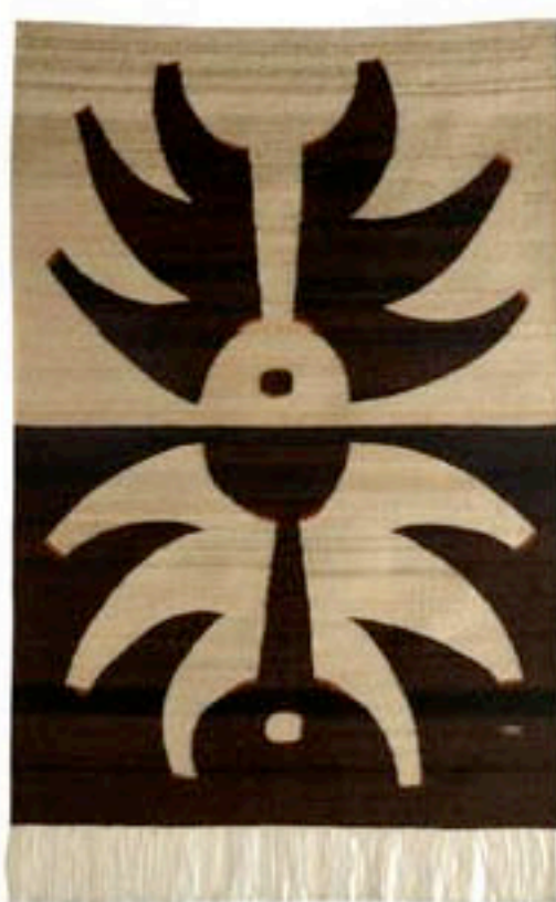
"Maguey" by Wence Martinez.

"The drawings of roots became broader talismans, symbols of the spirit of the plants," she continued. "They are meant to honor, uplift and energize the sacred and the natural in the face of a tenacious assault by corporate, genetically altered, experimental food crops."